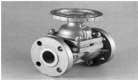
AK-8114C DIAPHRAGM VALVE (PORCELAIN & NEOPRENE) MATERIAL: CAST IRON SIZE: 1/2" THRU 10"