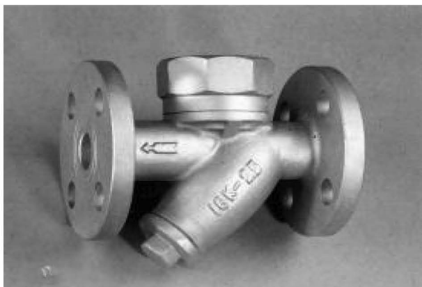
AK-8161 STEAM TRAP, FLANGED ENDS MATERIAL: C.I. FC-20, SAND CASTING SIZE: 1/2" THRU 2"