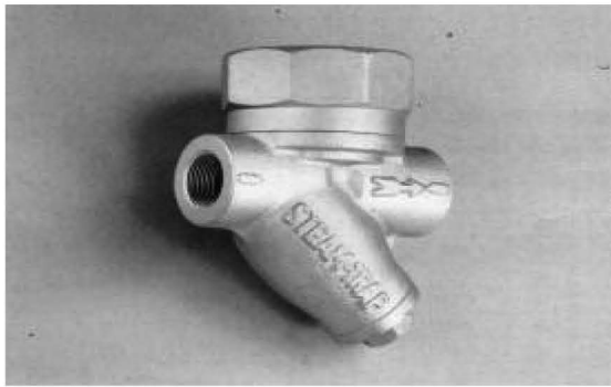
AK-8261 STEAM TRAP, SCREWED ENDS MATERIAL: C.I. FC-20, SAND CASTING SIZE: 1/2" THRU 2"