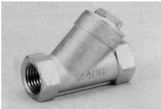
AK-8214 SCREWS END Y-TYPE PISTON CHECK VALVES MATERIAL: S.S. 316 300 WOG, INVESTMENT CASTING SIZE: 1/4" THRU 2"